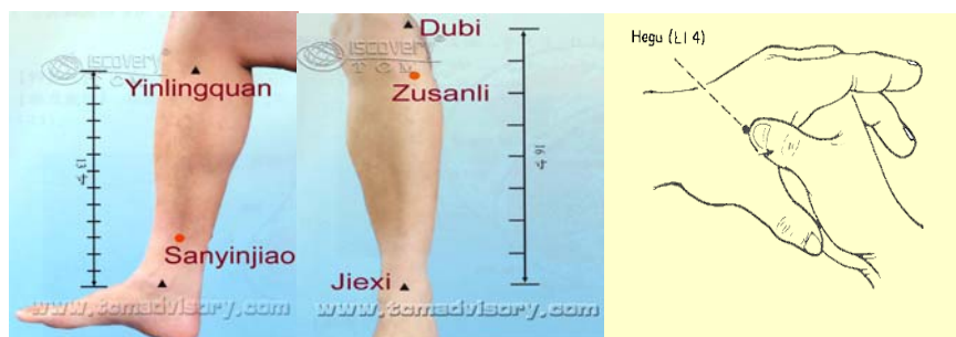
Figure 2. The locations of the acupoints LI4, ST36 and SP6

The oral educational session was supplemented with pamphlets, demonstrating the technique of pressing the true acu-points with accurate duration, showing posters and slides by PowerPoint Software for the experimental group after providing full explanation about the research objective. The same researcher educated the placebo group about the procedure of touching at the same acu-points (except providing pamphlet). One of the required acupoints was L.I.4 or Hegu channel which is the major painless relaxant point. It is located on the dorsum of the hand, between the 1st and 2nd metacarpal bones, in the middle of the 2nd metacarpal bone on the radial side, when the thumb is fully extended, i.e. the bones of the thumb and the first finger. The other is the ST36 point or Zusanli which is to the lateral side of the middle toe, 3 individual cun below the genu, i.e. on the anterior lateral side of the leg, one finger breadth (middle finger) from the anterior crest of the tibia, which is one of the most effective locations for reduction of fatigue and a general balance point. The last point is SP6 or Sanyinjiao, which is on the medial side of the leg, 3 cun above the tip of the medial malleolus, posterior to the medial border of the tibia, is one of the major and most commonly used channels (Molassiotis, Sylt, & Diggins, 2007) which is shown in Figure 2.